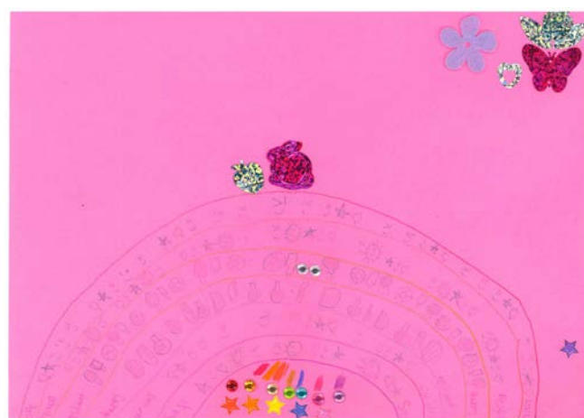
Competition entry 4