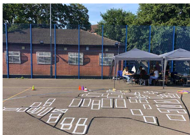
Fig 2: Taped out estate on the MUGA, 30th July 2024