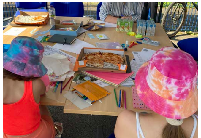
Fig 8: 30th July 2024