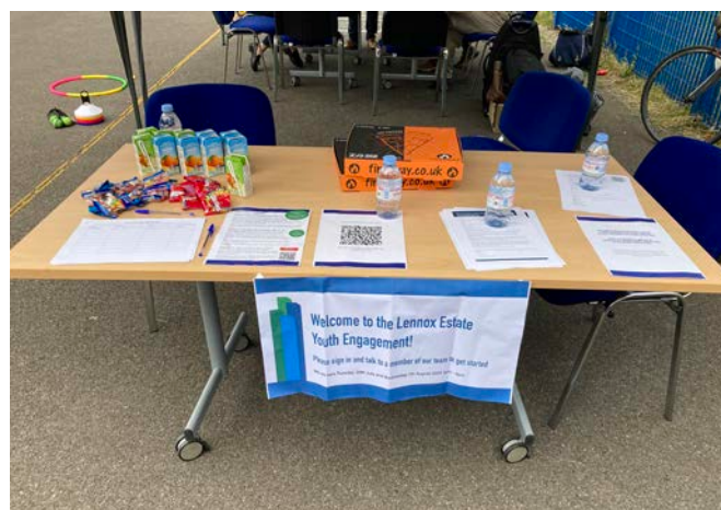
Fig 1: Sign in table, 7th August 2024

The multi-media competition (see Appendix 2) was launched via the newsletter and engagement platform also making it available to those who were unable to attend and participate in person. The competition will remain open for residents to enter until the residents exhibition currently planned for October 2024. All entries will be exhibited at the event and a winner will be announced during the exhibition.