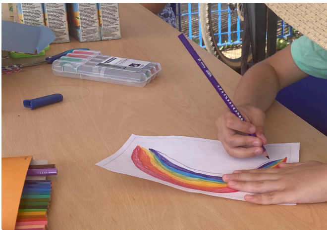
Fig 7: 30th July 2024