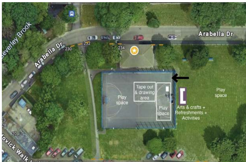
Page 4 of 5 Document1