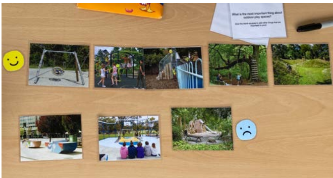
Fig 5: Types of outdoor play spaces ranked by 8yr old girl