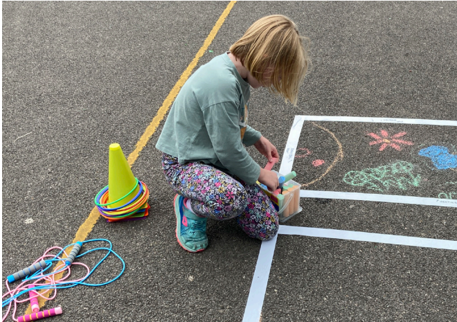
Fig 3: Young resident drawing on MUGA, 7th August 2024