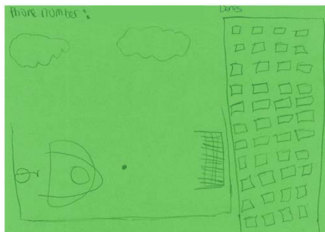
Competition entry 2