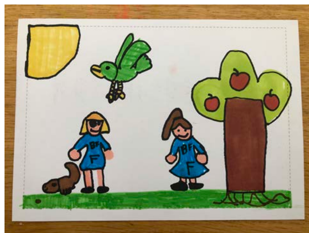
Competition entry 6