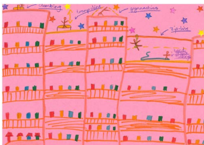
Competition entry 3