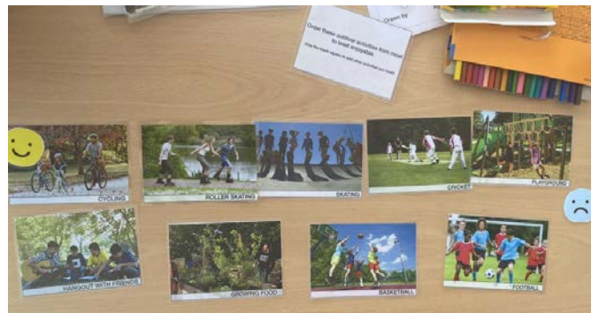
Fig 6: Types of outdoor activities ranked by 7yr old girl