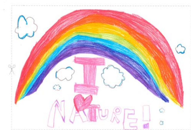
Competition entry 1