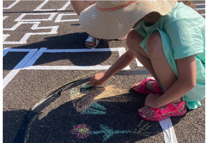
Fig 4: Young resident drawing on MUGA, 30th July 2024